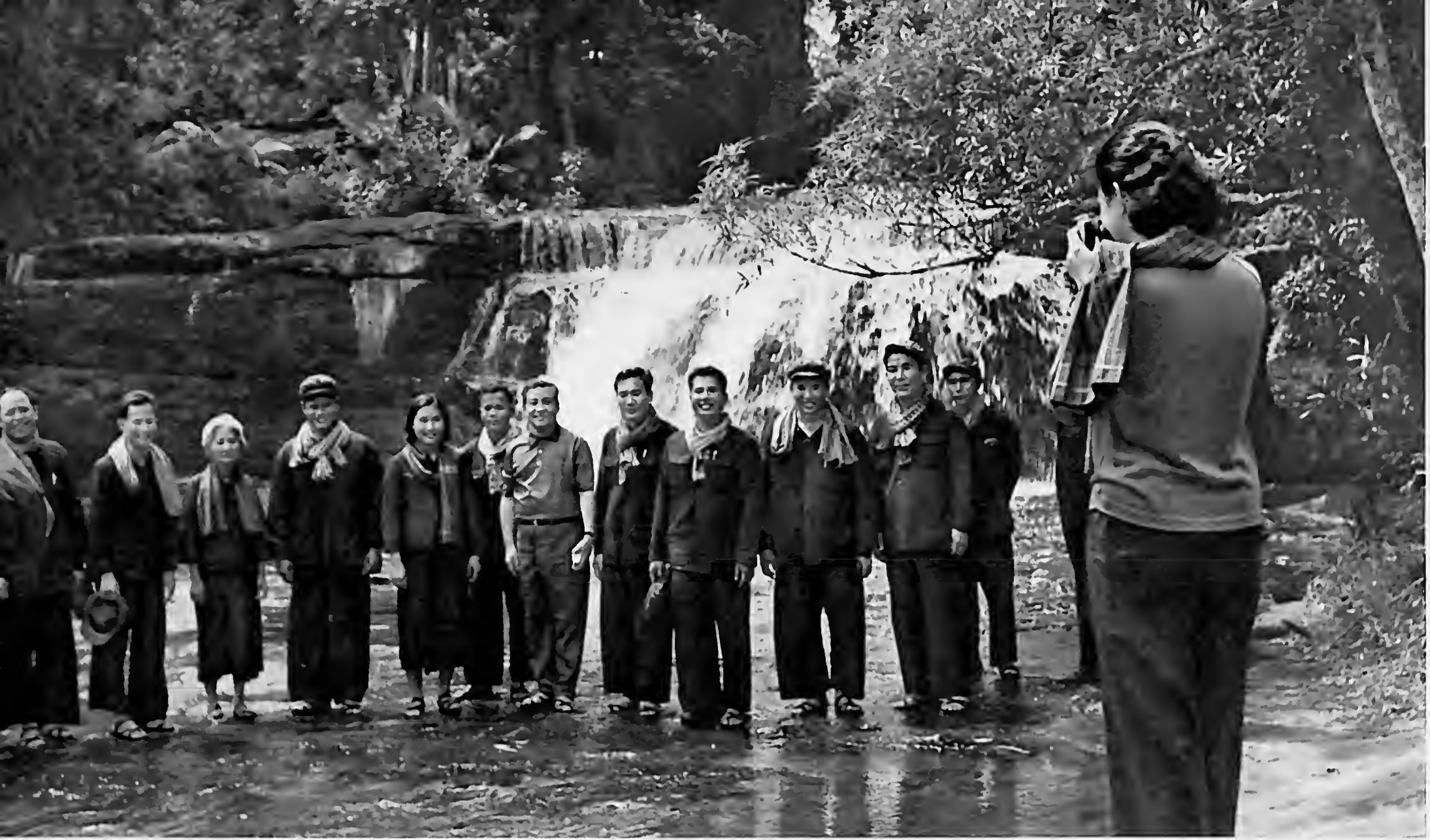
Khmer Resistance Movement leaders appreciate photos taken of them by Madame Sihanouk.